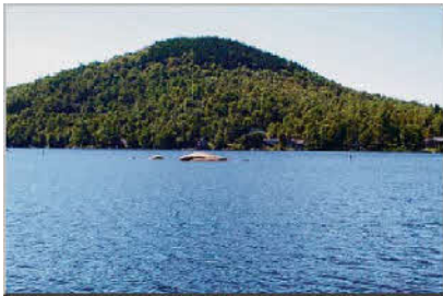
Sand Pond in Marlow, at 64 acres in surface area and 71 feet at its deepest, is larger and deeper than Kolelemook Lake in Springfield which is 40 acres in surface area and 22 feet deep!

One of the most common questions I get as a limnologist is, "What is the difference between a lake and a pond?" If you are like most folks, you probably think that lakes are bigger and deeper than ponds – this isn't always the case! (Incidentally, the second-most common question I get is, "What is a 'limnologist?'" – a limnologist is a scientist who studies freshwater including lakes and ponds.) In New Hampshire, there are many examples of a waterbody being called a "pond" when it is larger and deeper than another waterbody called a "lake." For example, Loon Pond in Gilmanton is 49 acres in surface area and 45 feet at its deepest point, while Loon Lake in Plymouth is 45 acres in surface area and its maximum depth is only 29 feet!